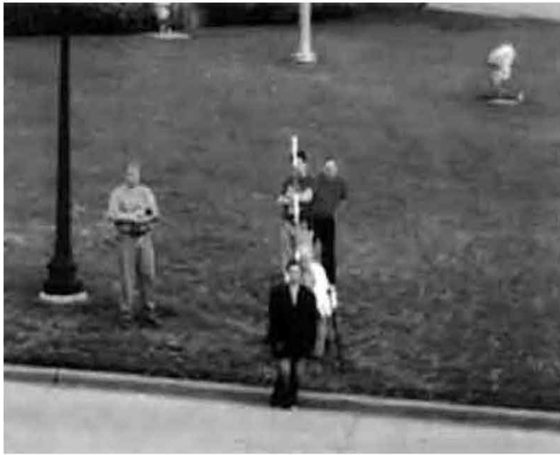
Figure 3. Where Moorman actually stood, by her own words, although the road has been repaved multiple times in the interval. Without these additional layers, she could probably have stood erect, with the camera to her eye, just as she is shown in the Zapruder film.